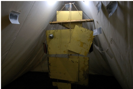
Figure 4: Tent installation created with found materials from the ruins of an institute in Vancouver (Ottawa).

For 2012, The Encampment will look at the civilian history of the War of 1812. 200-tents, referencing the bicentennial of the War of 1812, will be set up on the grounds of the Fort York National Historic Site.