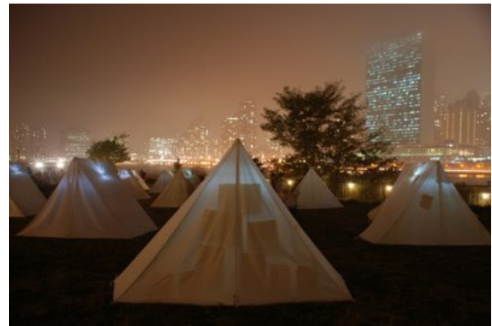
Figure 5: Shadows from tents with UN in background (NYC).