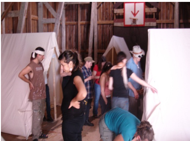
Figure 6: Installation Creation Workshop

On January 17, 2012, a Call for Public Participation will go out to invite the public to participate in the creation of The Encampment as either Creative or Production Collaborators. The outreach campaign will be undertaken in and around Toronto, the regions along the north shore of Lake Ontario, Southern Georgian Bay, Sault Ste. Marie/ Algoma, Stoney Creek and Niagara, as well as with the Mississauga First Nation and Six Nations.