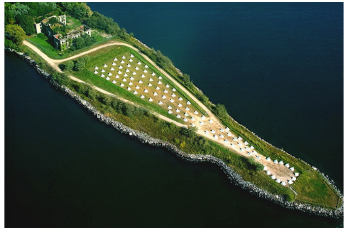
Figure 3: New York City (history of quarantine on Roosevelt Island)